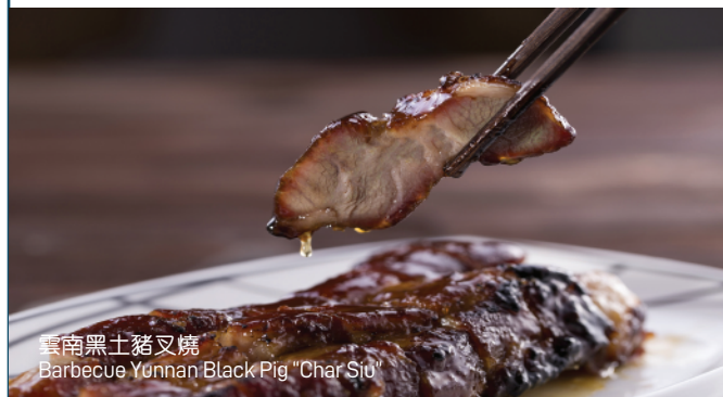
雲南黑土豬叉燒 Barbecue Yunnan Black Pig "Char Siu"