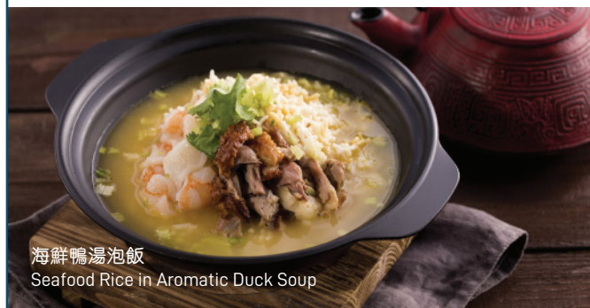
海鮮鴨湯泡飯 Seafood Rice in Aromatic Duck Soup